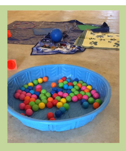
Mental Stimulation Play Area

http://www.sportdogtrainingcenter.com/potty-training-puppies/